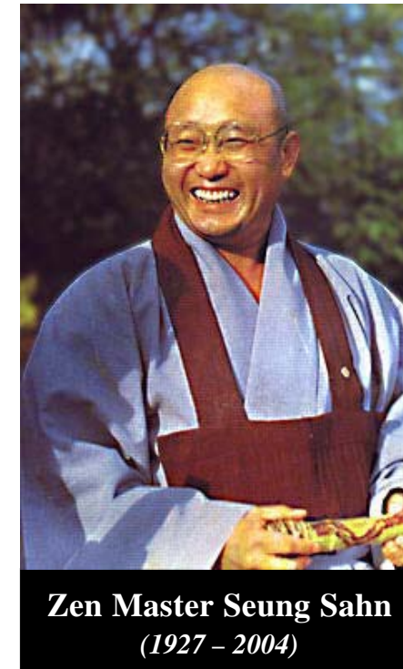
Zen Master Seung Sahn (1927 – 2004)

One clear, crisp winter's day in November 2004, a number of Zen Master Seung Sahn's close disciples gathered in his room at Hwa Gye Sa temple in Seoul, greatly concerned about their teacher's health. One of them asked him gently, "Zen Master, what shall we do after you pass into Nirvana?"